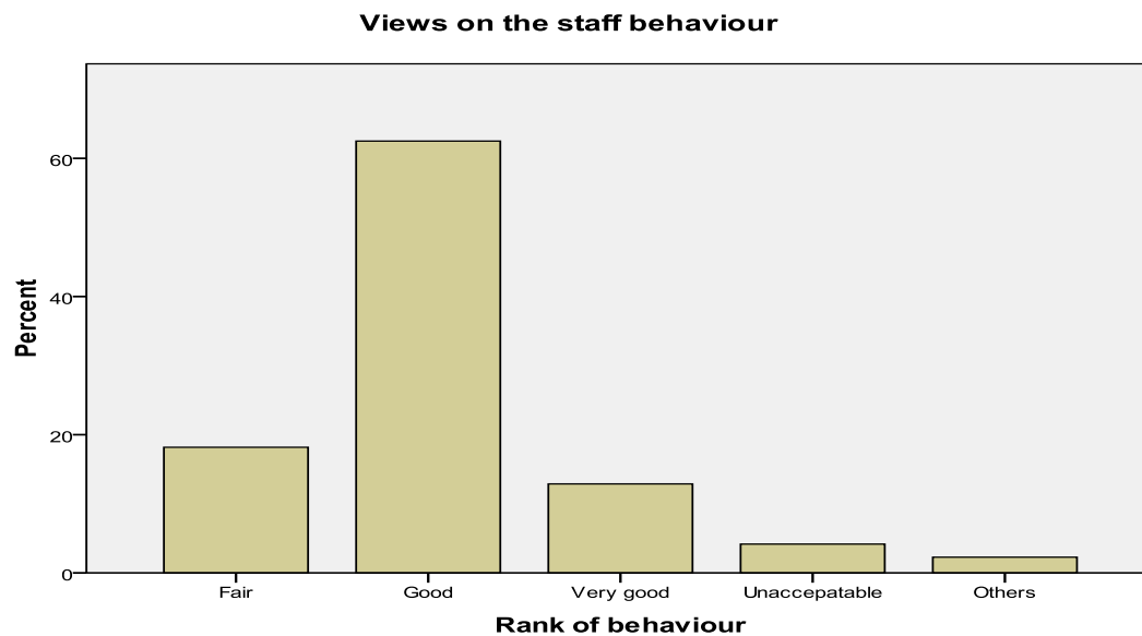
Figure 3: Views on the staff behaviour