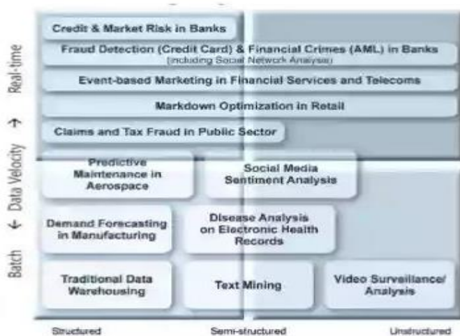
Fig 5:- Structure of Big Data

data. Just as with structured data, unstructured data is either machine generated or human generated.