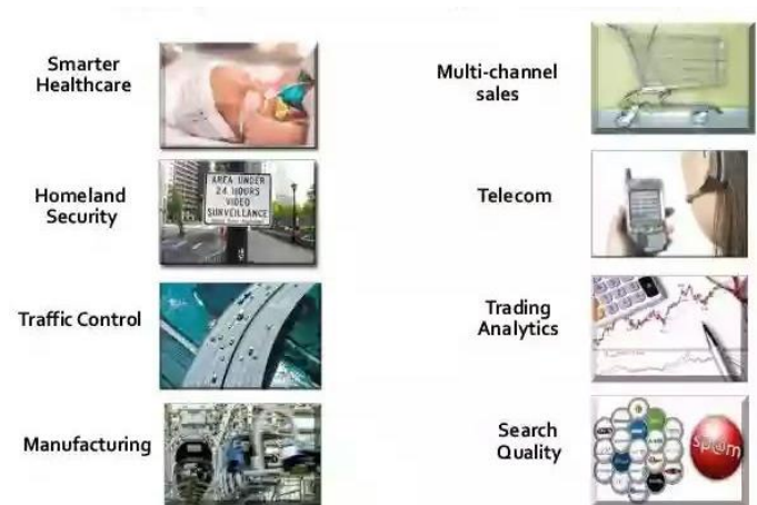
Fig 6:- Application of Big Data

Big data analytics is the process of examining large data sets containing a variety of data types -- i.e., big data -- to uncover hidden patterns, unknown correlations, market trends, customer preferences and other useful business information. The analytical findings can lead to more effective marketing, new revenue opportunities, better customer service, improved operational efficiency, competitive advantages over rival organizations and other business benefits. The primary goal of big data analytics is to help companies make more informed business decisions by enabling data scientists, predictive modelers and other analytics professionals to analyze large volumes of transaction data, as well as other forms of data that may be untapped by conventional business intelligence (BI) programs. That could include Web server logs and Internet click stream data, social media content and social network activity reports, text from customer emails and survey responses, mobile-phone call detail records and machine data captured by sensors connected to the Internet of Things. Some people exclusively associate big data with semi-structured and unstructured data of that sort, but consulting firms like Gartner Inc. and Forrester Research Inc. also consider transactions and other structured data to be valid components of big data analytics applications Application of big data analysis.