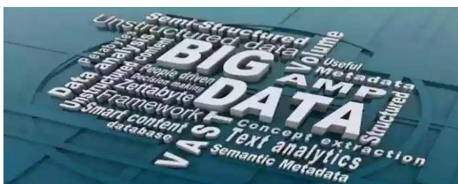
Fig 1:- Big Data

Big data is the term for data sets so large and complicated that it becomes difficult to process using traditional data management tools or processing applications. 'Big Data' is similar to 'small data', but bigger in size. But having data bigger it requires different approaches:- Techniques, tools and architecture. Big Data generates values from the storage and processing of very large quantities of digital information that cannot be analyzed with traditional computing techniques. Big Data may well be the Next Big thing in the IT world. Big data burst upon the scene in the first decade of the 21 st century. The first organization to embrace it was online and starts up firms like Google, eBay, Linked, and face book were built around big data from the beginning. Like many new information technologies, big data can bring about dramatic cost reductions, substantial improvements in the time required to perform a computing task or new product and product and service offerings.