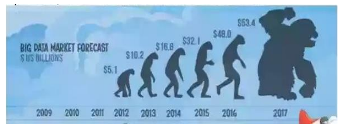
Fig 2:- customer transaction

Walmart handles more than 1 million customer transaction every hour. Facebook handles 40 billion photos from its user base. Decoding the human genome originally took 10 years to process; now it can be achieved in one week.