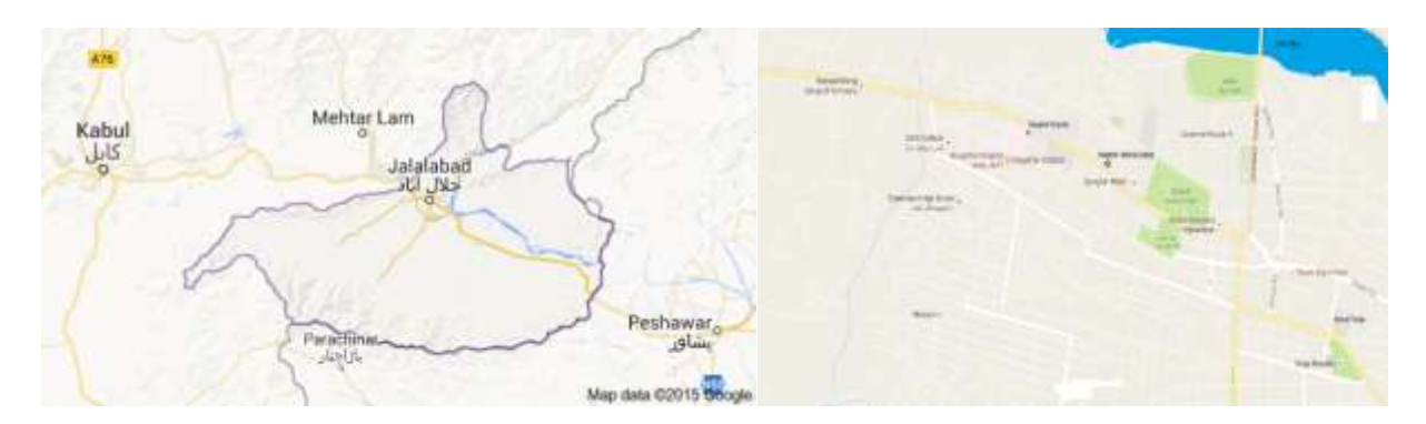
Figure-1: Study area, Nangarhar Province

The study was conducted at Nangarhar Teaching Hospital and Nangarhar Regional Hospital. These hospitals are the principal hospitals at the area, which are located in Jalalabad center of Nangarhar. Nangarhar is an eastern province of Afghanistan. Nangarhar province is the second overcrowded province with three millions of estimated population that has border with Pakistan. The climate of the center Jalalabad is tropical and temperature varies from 20 to 44 °C at different seasons of the year.