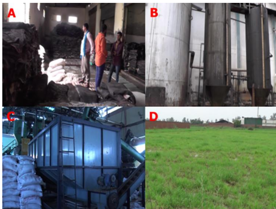
Figure 5: A. Solid waste management; B. Tallow manufacturing unit; C. Nutrition manufacturing unit & product and D. utilization of treated effluent into horticulture.

Total Dissolve Solid (TDS) content in treated wastewater and bore well sample are 1704 (2100 mg/l as per BIS: 3025) and 352 mg/l, (500 mg/l as per BIS: 10500) found below the standards respectively, while the TDS of the raw effluent is 4432 mg/l. It can also be observed that TSS content in treated wastewater recorded 16 mg/l and in the raw sample is 616 mg/l. Hence, TSS concentration cannot lead to the development of sludge deposits when treated wastewater is utilizing in horticulture and washing purpose.