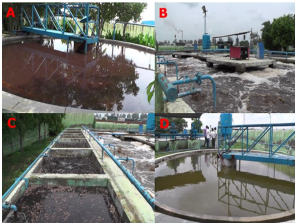
Figure 4: A. Primary clearance tank; B. Ariation tank; C. Sludge activate tank and D. Secondary clearance/ policing tank and Carbon filter.

Accordingly, slaughterhouse wastewater has been classified as industrial waste in the category of agricultural and food industries. Wastewaters from slaughterhouses and meat processing industries have been classified by Environmental Protection Agency (EPA) as one of the most harmful to the environment and also to health of the people living in surrounding area ( Walter et al., 1974 ). For the treatment of this type of wastes, conventional biological processes do not offer the solution to satisfy environmental requirements. As an alternative to more efficient treatment process for treating highly loaded effluents, the anaerobic process is particularly designed to effluents discharged at high concentrations of COD and other biodegradable components ( Spece, 1999 ). Discharging slaughterhouse wastewater without treatment contribute to greatly degrading the aquatic environment and pollution of irrigation water ( Michael et al., 1988 ).