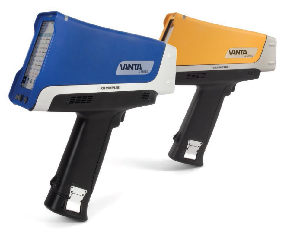
Figure 3: Image of HHXRF instrument

Different tea samples in the form of tea bags were procured directly from various distributors in India. Tea samples analyzed were 1) Duncans Double Diamond green tea manufactured by Duncans Tea Limited, Kolkata, India. 2) Koranganigreen tea manufactured by Korangani Tea Co. Pvt. Ltd., Guwahati, Assam, India. 3) Cambridge Tea Party green tea manufactured by Snowlan Epicure Pvt. Ltd., Pune, India. 4) Typhoo green and black tea manufactured by MadhuJayanti International Pvt. Ltd., Kolkata, India. 5) Tea-a-me green and black tea manufactured by LMJ International Ltd., Kolkata, India. 7) Tata Agni black tea manufactured by Tata Global Beverages, Bengaluru, India. 8) Brook Bond Red Label black tea manufactured by Hindustan Unilever Limited, India.Each tea sample was dried at 110°C for 3 hours in a vacuum oven to remove moisture content. The dried tea leaves were ground to fine powder using a mortar and pestle and stored in airtight bags till analysis.